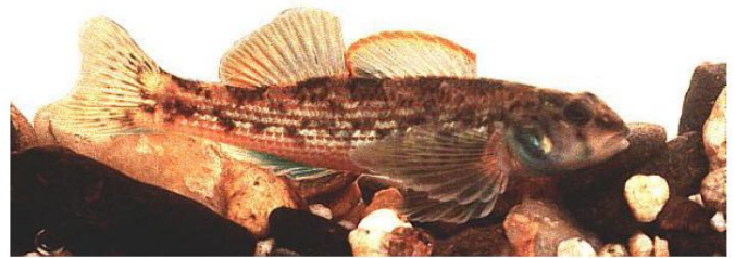
Figure 1. A male turquoise darter

http://people.clemson.edu/~jwfoltz/Research/reports/darter/thesis/Irwin.pdf ). Every riffle in the Clemson Forest has turquoise darters residing on them. Recent stockings have been made for the purpose of additional genetic diversity.